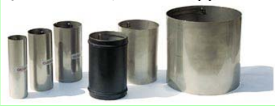
Quick-Lock sleeves; 6 to 24 inches pipe size